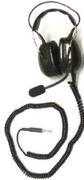
HEADSET for TENDER