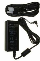
12 Volt Charger